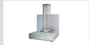
Clemex Powder Disperser