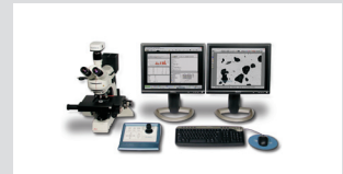
Clemex Vision PE

Capture images from multiple devices and share information with your colleagues or customers by easily adding non-destructive annotations and applying a host of direct measures.