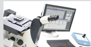
Phase Analysis Package