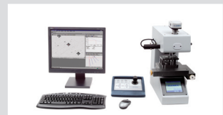
Clemex Particulate Filter