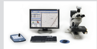
Clemex Particulate Filter